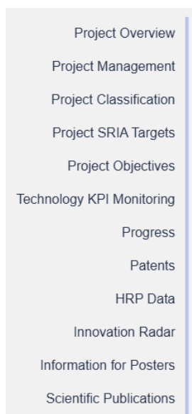
Figure 1. Structure Clean Hydrogen Platform

The Clean Hydrogen platform is subdivided into different sections, which are shown in Figure 1 and described in the following sections, showing the current status of information about the project that has been completed for the year 2024.